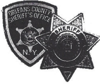
Randall Bower Sheriff